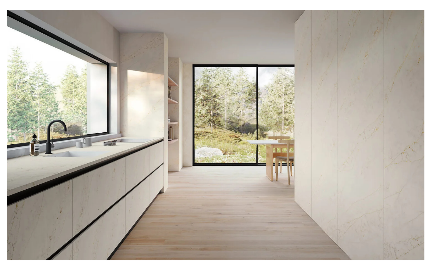
Colours and brightness of video and printed reproductions are indicative. The slab simulates natural stone so, some changes are possible in the final product.